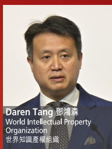
Daren Tang 鄧鴻森 World Intellectual Property Organization 世界知識產權組織

* Survey conducted by CAP Strategic Research during the Forum 調查機構嘉柏市場策略研究於論壇期間進行訪問