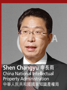
Shen Changyu 申長雨 China National Intellectual Property Administration 中華人民共和國國家知識產權局