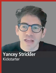
Yancey Strickler Kickstarter