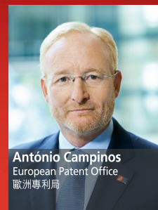
António Campinos European Patent Office 歐洲專利局