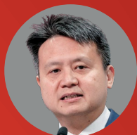
Daren Tang 鄧鴻森 World Intellectual Property Organization 世界知識產權組織