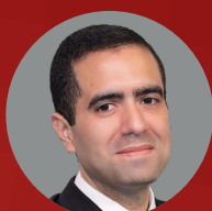
Carlos Castro International Olympic Committee 國際奧林匹克委員會