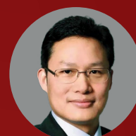
Ge Jun 戈峻 Toloy Shared Holding Group 天九共享集團