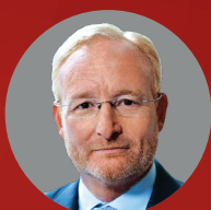
António Campinos European Patent Office 歐洲專利局