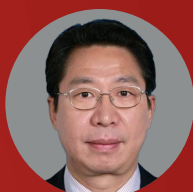
Shen Changyu 申長雨 China National Intellectual Property Administration 中華人民共和國國家知識產權局