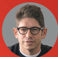
Yancey Strickler Kickstarter