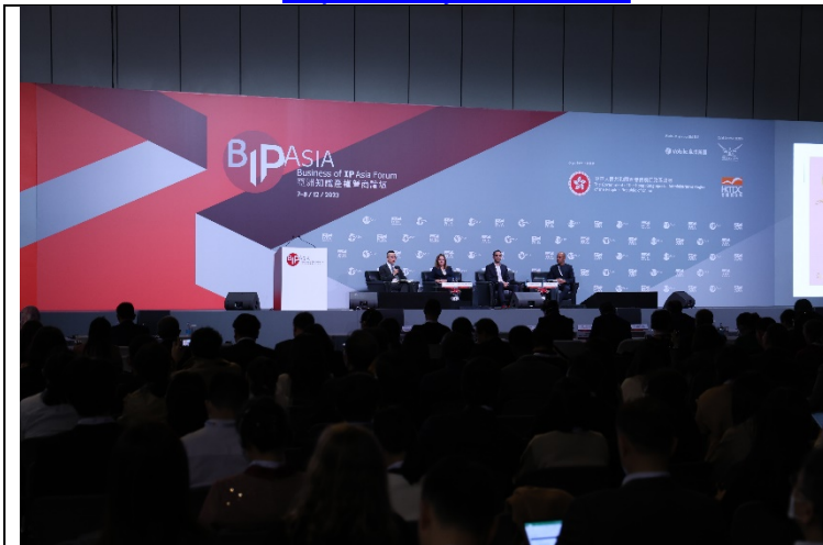
The 14th BIP Asia Forum , jointly organised by the HKSAR Government and the HKTDC, will be held from 5 to 6 December 2024 at the Hong Kong Convention and Exhibition Centre (The photo shows last year's event )